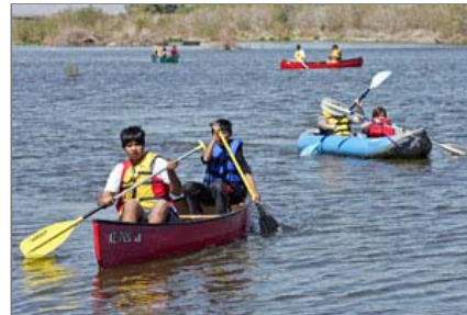
TRES RIOS NATURE FESTIVAL GOERS canoe on the Gila River last March. The event, which features outdoor activities including archery, canoeing and fishing, has been held annually in the spring and will now be held in the fall as well.