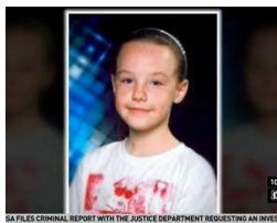
Police search for