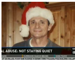
Ex Flagstaff Police