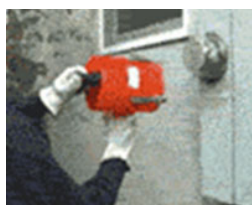
Power Companies HATE This CutYourElectricBill