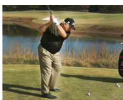
PGA Pro Tells All Square to Square Method

from azcentral, The Arizona Republic and 12 News.