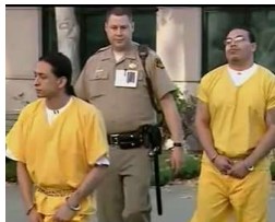
Homecoming dance gang rape trial