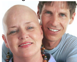
5 Signs You'll Get Cancer New smax