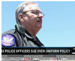
2500 Phoenix police officers file a class action lawsuit