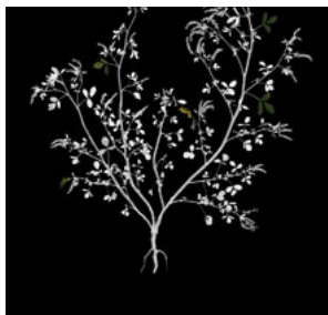
"Yellow Sweet Clover" by Jimmy Fike, photograph, 2011.

See all stories published in Arts&Culture