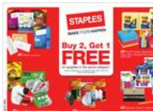
Staples USA 5 Days Left