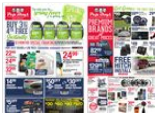
Pep Boys 6 Days Left